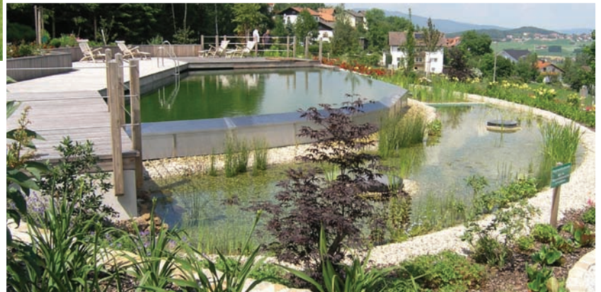
BioNova multi-chamber design