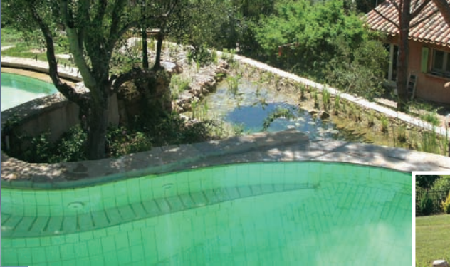
Photo shows a traditional swimming pool converted into a BioNova natural pool.

Whether you prefer a classically formal pool, a naturally integrated rock-rimmed pool or even wish to transform your existing chemically-treated in-ground pool into a BioNova Natural Swimming Pool, we can accommodate you. Each of our installations are custom designed to complement your property, home and lifestyle.