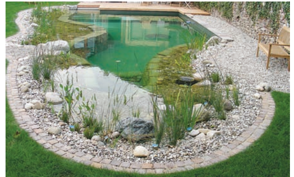
BioNova single chamber design